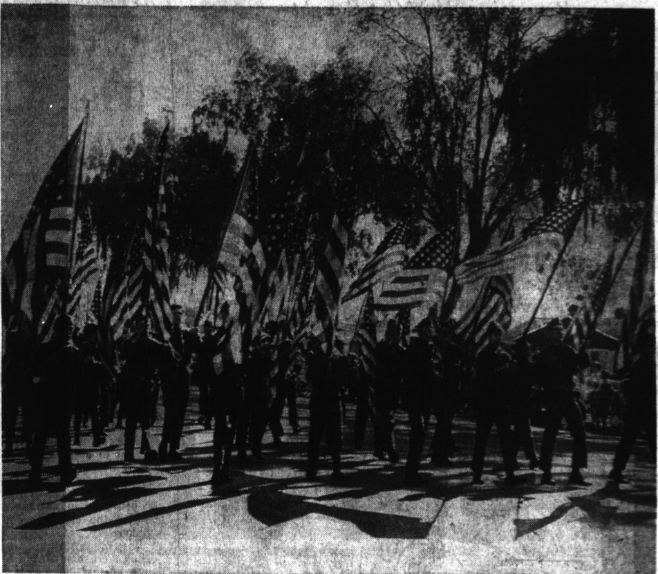
A SEA OF FLAGS . . . Massed colors made a spectacular sight as about 4,000 Boy Scouts, Cubs, and Explorers marched under sunny skies in the city's annual Boy Scout Parade, In addition to the march-