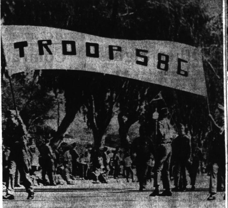
BANNER BEARERS... Nobody was left in doubt when Torrance Troop 586 marched down Torrance Boulevard during Saturday's fifth annual Boy Scout Parade. The banner spelled it out for all to see. This unit's scouts were among the approximately 4,000 that joined in the 57th anniversary observance of the Boy Scout movement.