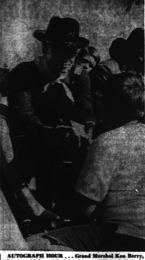
to television fans as F Troop's Capta at much of his time on the reviewi