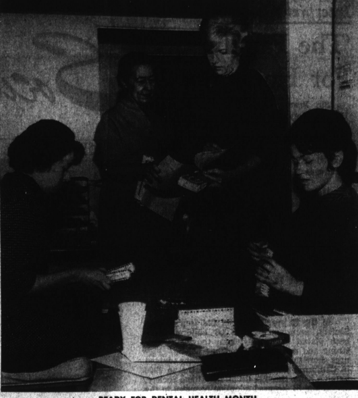
READY FOR DENTAL HEALTH MONTH

FROSTING INCLUDING SHAMPOO & SET FROSTING OPEN 6 DAYS, 5 NITES BANKAMERICARD. 17434 PRAIRIE-TORRANCE ORCHID LADY