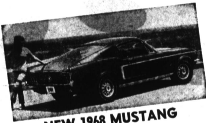
NEW 1968 MUSTANG