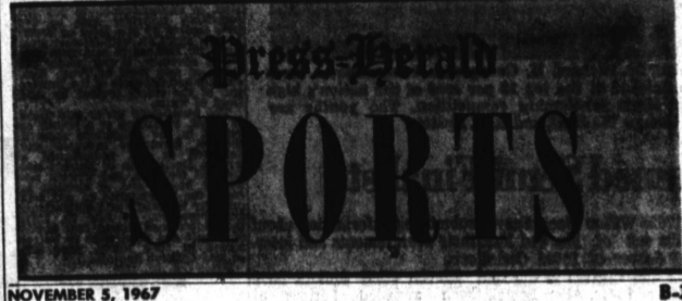
NOVEMBER 5, 1967