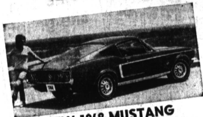
NEW 1968 MUSTANG

STRIKE IS OVER! ORDER YOUR 1968 FORD NOW