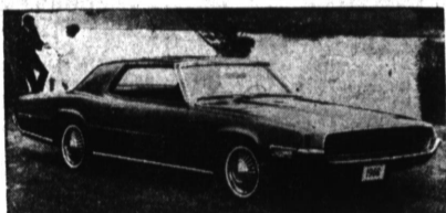
NEW 1968 THUNDERBIRD