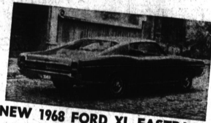
NEW 1968 FORD XL FASTBACK