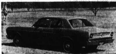
NEW 1968 FALCON

SEE THE ALL NEW 1968 FORDS NOW AT DICK WILSON FORD