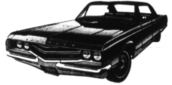
1968 CHRYSLER MOVE UP TO CHRYSLER

TAKE THAT SHORT FREEWAY DRIVE TO RAY VINES