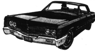
1968 IMPERIAL CLASSIC BEAUTY