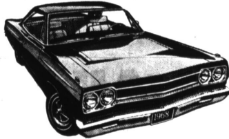
1968 PLYMOUTH MORE BEAUTIFUL THAN EVER