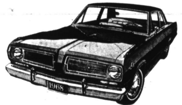
1968 VALIANT COMPLETELY RESTYLED

MOST MODELS READY FOR IMMEDIATE DELIVERY