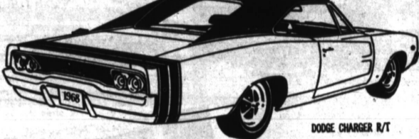
DODGE CHARGER R/T