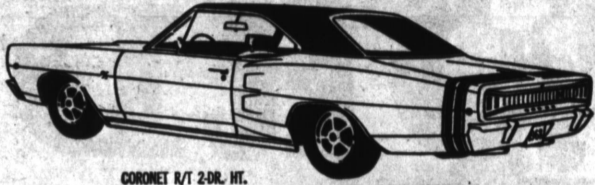
CORONET R/T 2-DR. HT.