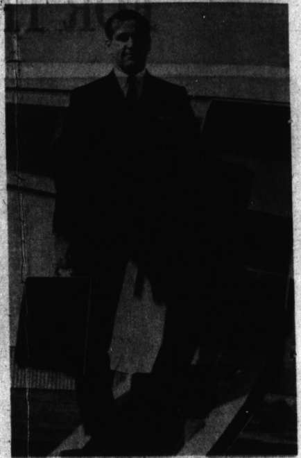
Heads Leasing Office