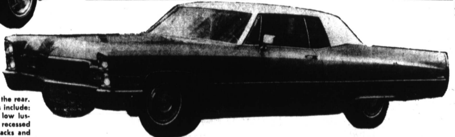
1968 CADILLAC COUPE DEVILLE

Exterior changes in the 1968 Cadillac, as shown in this Coupe de Ville, include a new grille and larger parking lights in the front, redesigned cornering lights and new marker lights on the side plus a new deck lid and all chrome bumper in the rear. On the inside, safety related product improvements include: added cushioning in the instrument panel, use of low luster paint on interior components to reduce glare, recessed door handles, adding padding in the front seat backs and a new inside rear view mirror which will bend away from either a forward or a side impact.