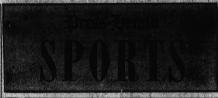
A-6 SEPTEMBER 20, 1967

A time extension has been approved by the Regional Planning Commission for the construction of an additional 10 apartment units at 1459 E. Carson St. The permit was extended to June 21, 1968.