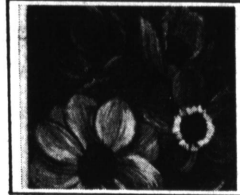
ANEMONE COLLECTION French "Anemone de Caen" varieties resemble huge Poppies. Large bulbs producing over 50 flowers per bulb—red, white and blue mixtures. 100 bulbs 97¢

2545 PACIFIC COAST HWY. — ROLLING HILLS PLAZA — TORRANCE