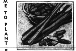
"CHERRY-SWEET" RHUBARB Flavor fresh-picked Rhubarb pies, sauce and juice. So sweet it requires less sugar than old fashioned varieties. Heavy jumbo roots 2 roots 97¢

COUPON 10 OZ. AEROSOL "ORTHO" HOUSEHOLD SPRAY 43c ea Reg. 98c Limit 2 Per Coupon KILLS ANTS — ROACHES — FLIES — SILVERFISH ETC.