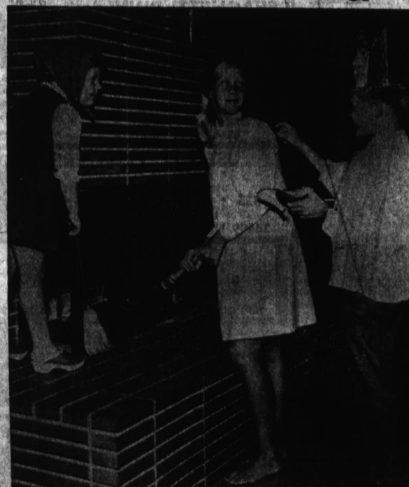
Scene from Cinderella