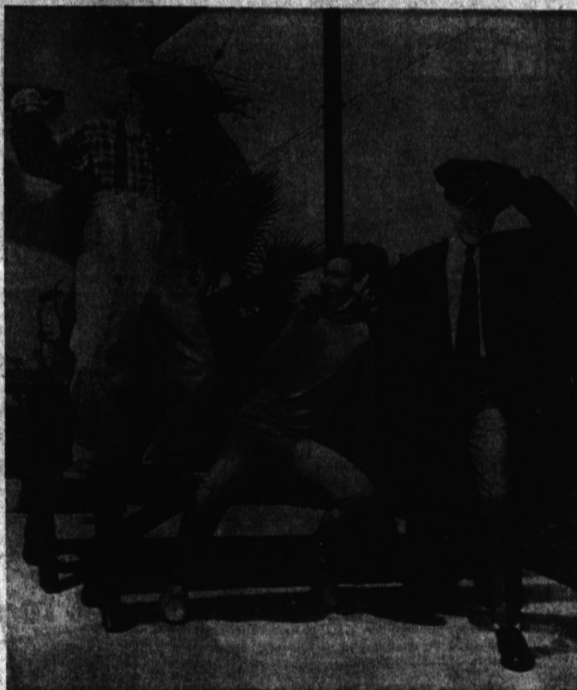
Wizard Of Oz

He also joins in with a song now and then.