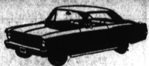
1967 CHEVY II NOVA HARDTOP, COUPE