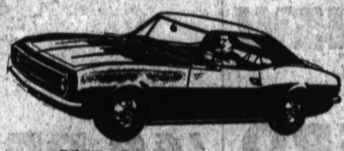
1967 CAMARO COUPE