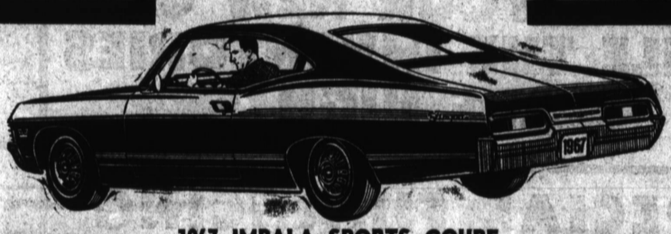
1967 IMPALA SPORTS COUPE