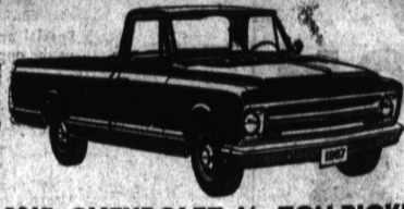
1967 CHEVROLET 1/2 TON PICKUP