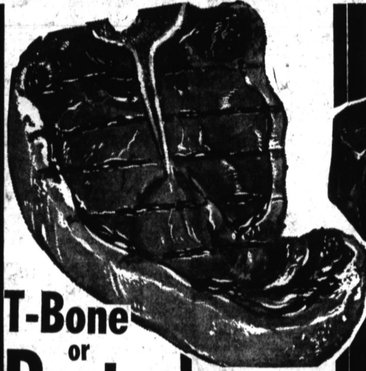
T-Bone or Porterhouse STEAKS