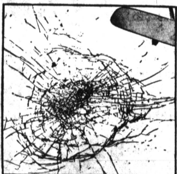
The very last thing.

The last thing Frank expected was someone running the stop sign.