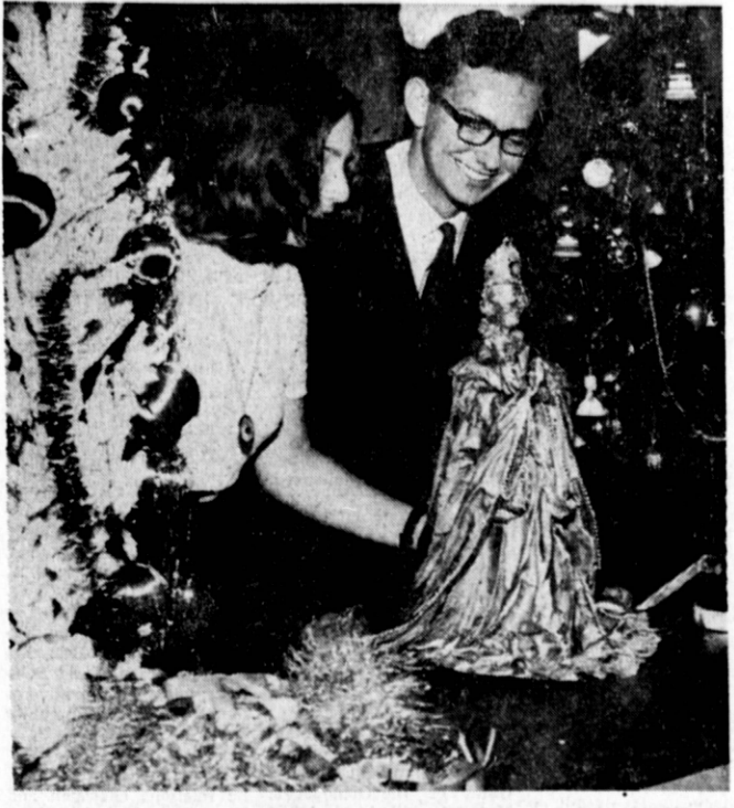
THE MEANING OF CHRISTMAS