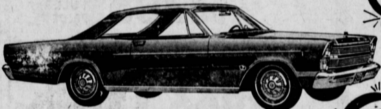
FORD GALAXIE 500 2-DR. HARDTOP

BRAND NEW '66 Fairlane Htp. Full factory equipment 6-cyl., std. trans. Full Price $2211 16 (66-1920)