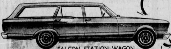
FALCON STATION WAGON

BRAND NEW '66 Falcon Wagon 6-cyl., Cruiseomatic, whitewalls, heater. SAVE $523 00 (66-1917)