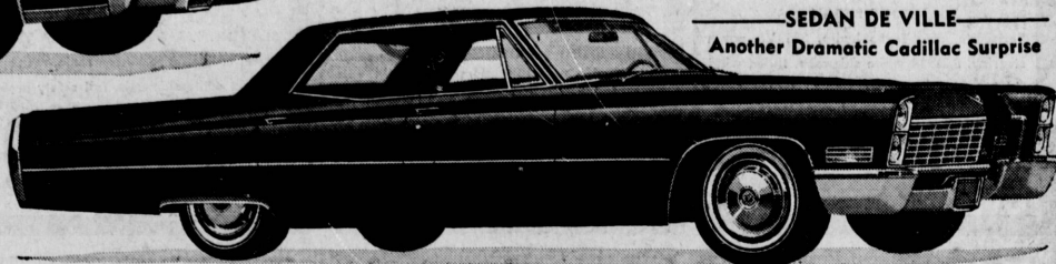
SEDAN DE VILLE Another Dramatic Cadillac Surprise

Buy or Lease Your 1967 Cadillacs From Ronald E. Moran Cadillac