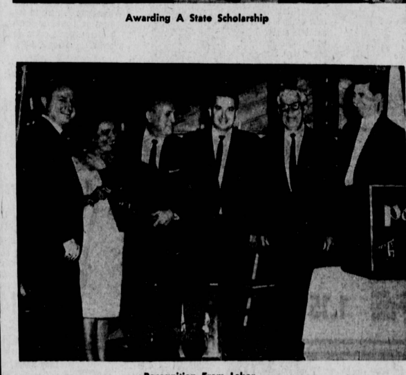
Recognition From Labor