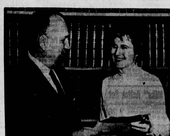
Awarding A State Scholarship