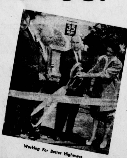
Working For Better Highways