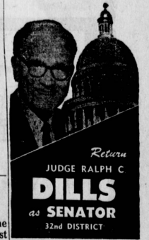
Return JUDGE RALPH C. DILLS 32nd SENATOR 32nd DISTRICT