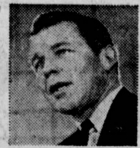
ROBERT FINCH Lt. Governor