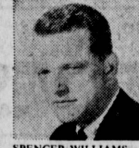
SPENCER WILLIAMS Attorney General