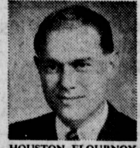
HOUSTON FLOURNOY State Controller