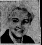
IVY BAKER PRIEST State Treasurer