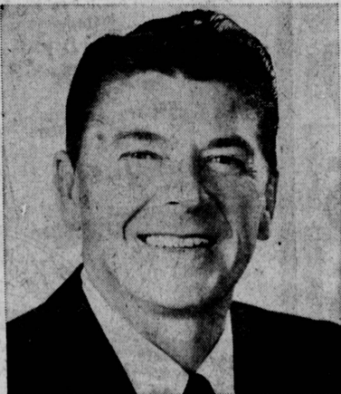
RONALD REAGAN Governor