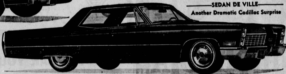
SEDAN DE VILLE