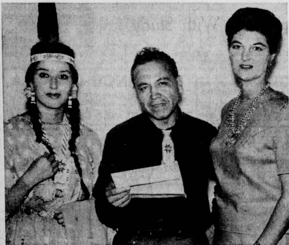
INDIAN FAIR THIS WEEKEND

17424 PRAIRIE-TORRANCE PHONES 371-5018 — 371-9234