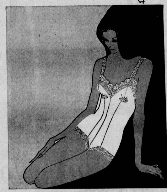
fashionable famous maker all-in-one briefer sale

Cuddle up in supple soft Antron® nylon velour. Wear it belted or loose in blue, moss green or melon. Available in sizes 10-18. may co robes and loungewear 53