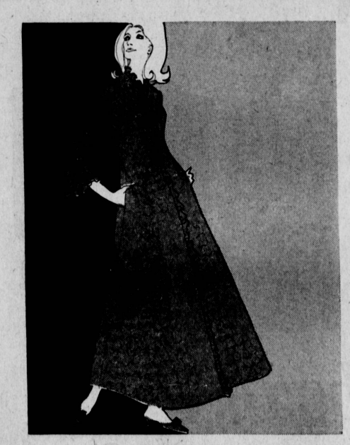
loungerobe special! quilted nylon velour