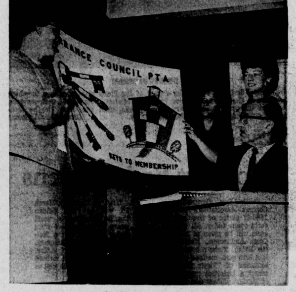
GET MEMBERSHIP DRIVE UNDER WAY

The topic was chosen be-cause of the interest and has been designed on a level to interest Bank Man-agement and Senior Em-ployes. There will be two speak-ers each evening and the speakers have been chosen thy can give on the sub-jets thy are to discus. Some of the topics cov-