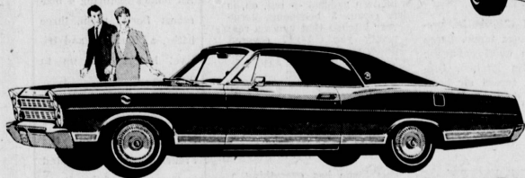
LTD BY FORD