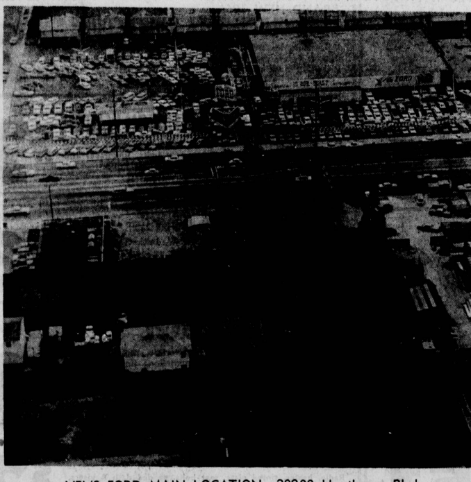
VEL'S FORD MAIN LOCATION-20900 Hawthorne Blvd.