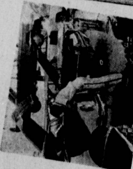
Value Sealed Used Car Reconditioning Department