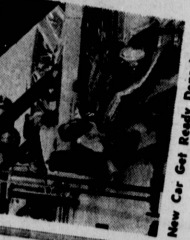
New Car Get Ready Department