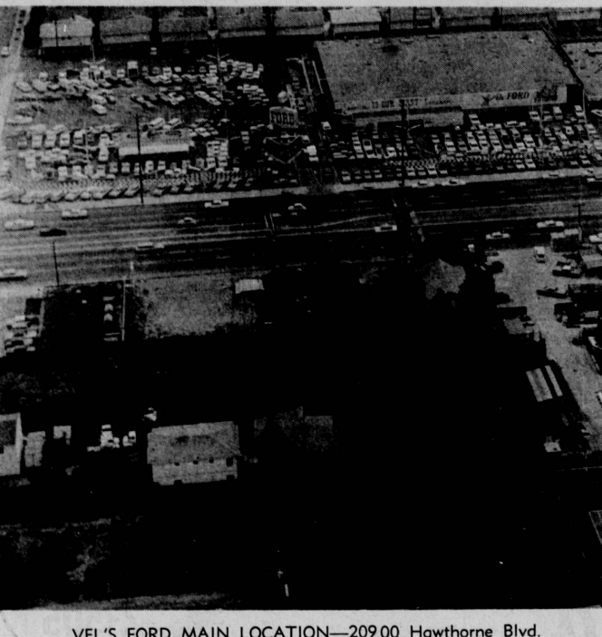
VEL'S FORD MAIN LOCATION-20900 Hawthorne Blvd.