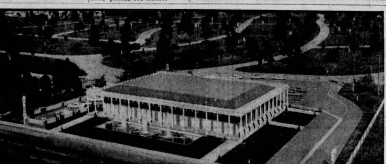
THIS IS THE ONLY MORTUARY WITHIN INGLEWOOD PARK CEMETERY