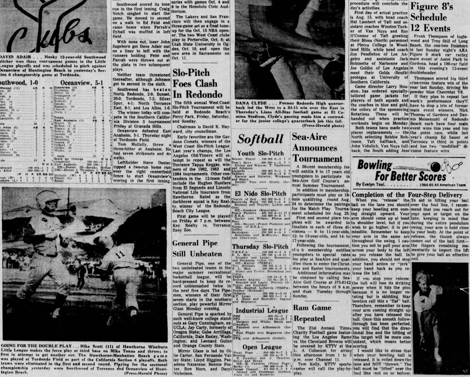
DING FOR THE DOUBLE PLAY ttle League makes the force play to get anothe Tordondo Field