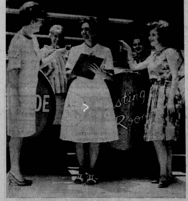
SPONSORSHIP FUND BENEFIT

Her fiance was graduated from the Port-land High School in 1963. He attended Monterey Peninsula Junior College and is now attending