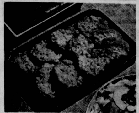
CRISPY CORN FRITTERS hit the spot during hot weather months. Deep fat frying is not so difficult as it appears; use your electric skillet to insure temperature control.