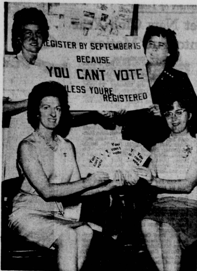
YOU CAN'T VOTE UNLESS YOU REGISTER