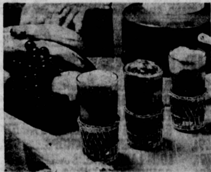
AFTER SWIM SNACK is Chocolate Refreshers, served right from the jug they're made in. Pass chilled fresh fruit for a refreshing and nourishing duo.

1 tube refrigerator biscuits Place chives, curry powder, garlic salt, brown sugar, chicken broth, pineapple juice and half the butter in a large skillet with removable handle. Heat until very hot, but not boiling. Stir in corn bread stuffing until thoroughly blended. Add apples and chicken. Separate each biscuit in half so you have 24 circles. Arrange circles over top of chicken, overlapping edges. Melt remaining butter and brush over biscuits. Brown at 425 degrees for 20 to 25 minutes, or until biscuits are puffed and golden brown. Serve from skillet. Makes 6 to 8 servings.