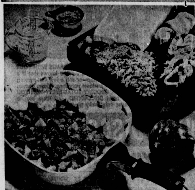
THE MELBA TOAST stuffing used in this Indian Chicken Pronto recipe allows the bread to absorb just the right amount of liquid to maintain a fluffy, moist consistency. Recipe uses a ready-mix stuffing.