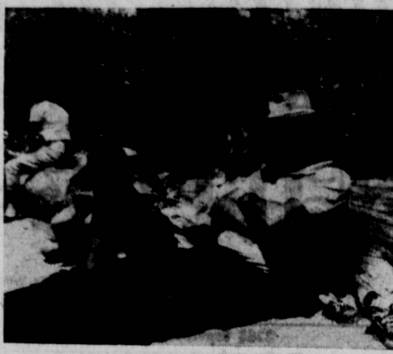
RELAXING . . . One of the many Torrance families which annually participates in the YMCA camping program is pictured relaxing at the annual family camp. This year's family camp will be held today, July 16, at Yosemite National Park.