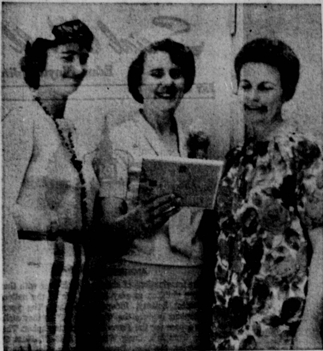
AWARDED HONORARY MEMBERSHIPS