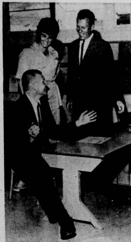
WHERE IT ALL BEGAN