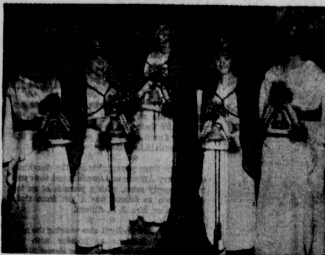
THE ROYAL COURT

Magruder PTA extended thank-yous to all the teachers, parents and children who assisted with the paper drive held June 3. Rooms 3 and 8 received a prize of a bag of popcorn and a reserved seat at the Billy Bart show held in the school cafeteria, June 4. 293 youngsters attended the two showings.