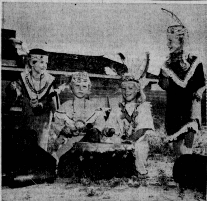
CAMP OUT AT MANZANITA PARK