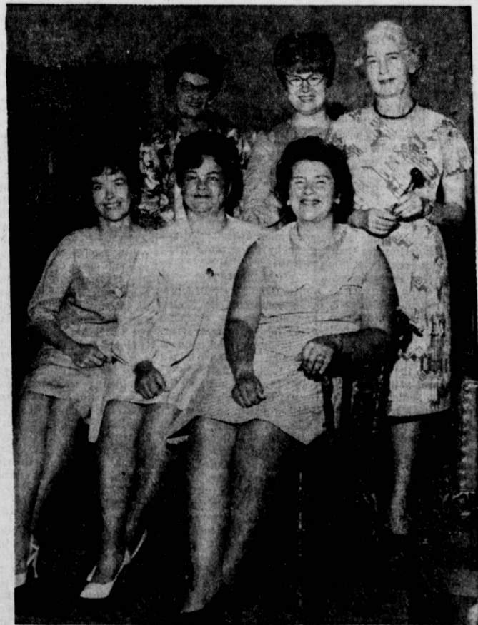
TO DIRECT CHURCH WOMEN

The Press-Herald office will be closed on Monday, July 4. Copy to appear in the Wednesday, July 6, women's section of this newspaper must be submitted not later than Friday morning, July 1.