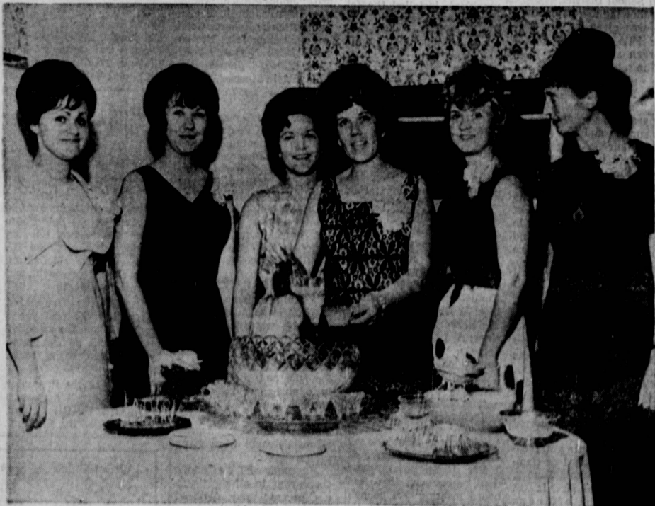
A JOB WELL DONE