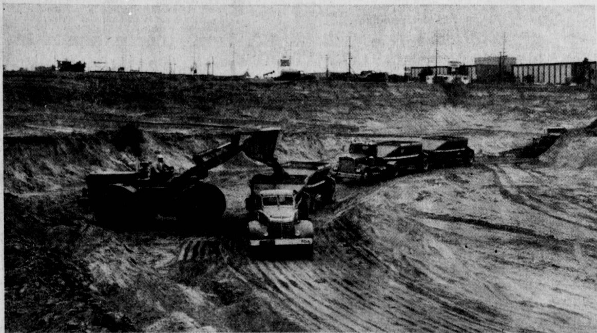
CANYON BUILDERS . . . Truck and trailer rigs await their turn to be loaded at Del Amo Financial Center where more than 400,000 cubic yards of dirt being moved to make way for the huge office building complex. Foundation grade is 27 feet below Hawthorne

Boulevard, identified in the background by the string of utility poles. Pouring of the foundation will be the first construction phase of the project, scheduled to be completed late next spring.