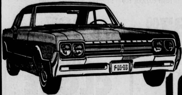
BRAND NEW F85 OLDS FOR '66