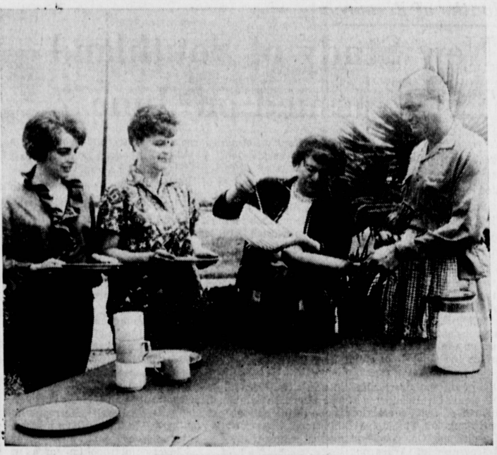
GET THEM WHILE THEY'RE HOT