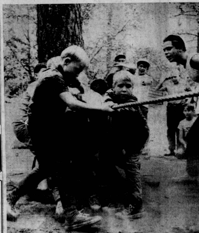
TOTE DAT BARGE... YMCA campers put all their sweat and toil into a rousing tug-o-war staged at last year's camping trip to Little Green Valley. There is still plenty of room for sign-ups to go on this year's trip to the same spot.