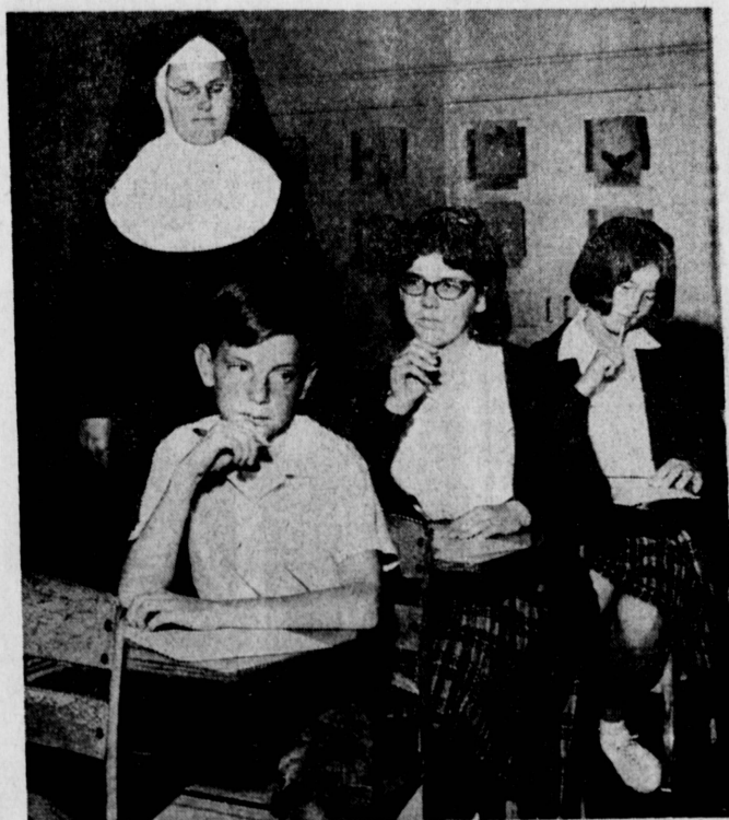
NATIVITY SCHOOL WINNERS