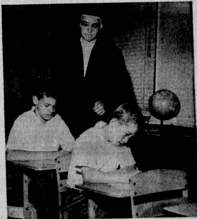
ST. MARGARET MARY POETS