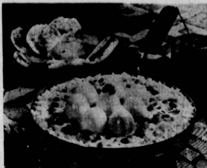
HARD COOKED EGGS stand to attention in a rich cream sauce made with chicken broth and fragrant with raisins, apples and lemon peel.

until meat is very tender. Melt butter, add onion and celery, cover and cook slowly 10 minutes. Blend in flour and curry powder. Add 2 1/2 cups broth from meat (add water if necessary, to make this amount) and raisins; cook and stir until thickened. Cut meat into bite sized chunks, add to curry and heat thoroughly. Serve on hot cooked rice. Accompany with condiments. Makes 4 to 5 servings.