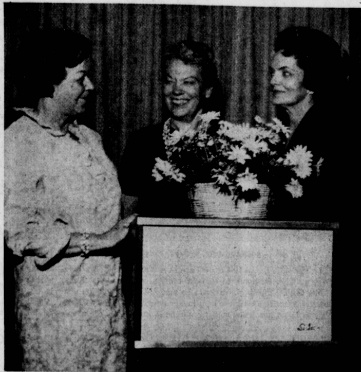
NEW GUILD LEADERS