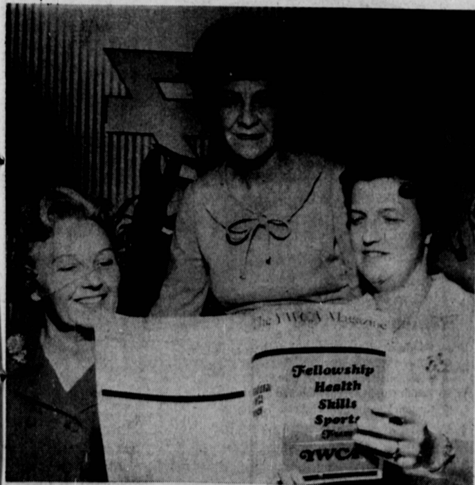
OFFICERS OF THE BOARD

Upon arrival in France in September, the students on the program, numbering 109 from 51 American colleges, will live in Tours, provincial capital of the chateau district, where they will have six weeks of intensive language drill. Late in October, they will move to Paris to enroll in the winter term at the University of Paris and associated institutions. In both cities they will live with French families.