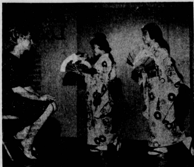
A TOUCH OF THE ORIENT