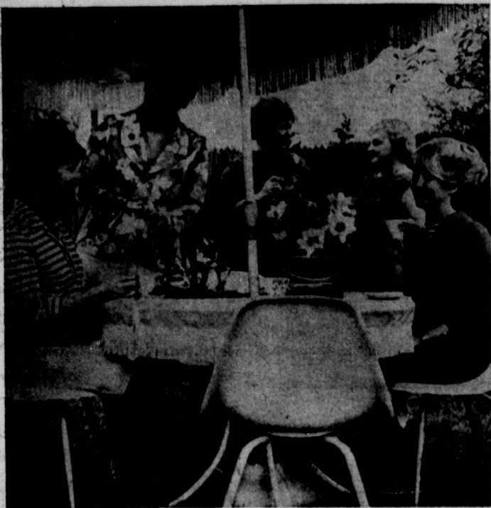
A WELCOME FOR NEW MEMBERS