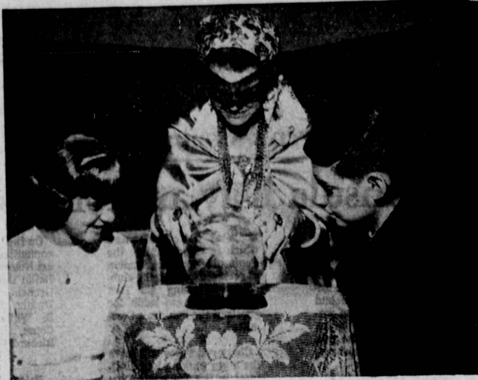
COME ONE COME ALL TO GALA DAY