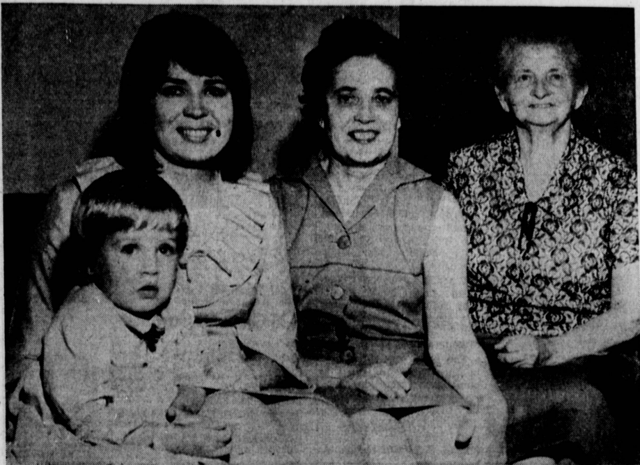
I AM AN AMERICAN