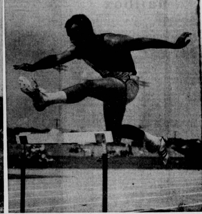
high hurdles in 14.7. Palos Verdes won the league title by outscoring West, 68-64.