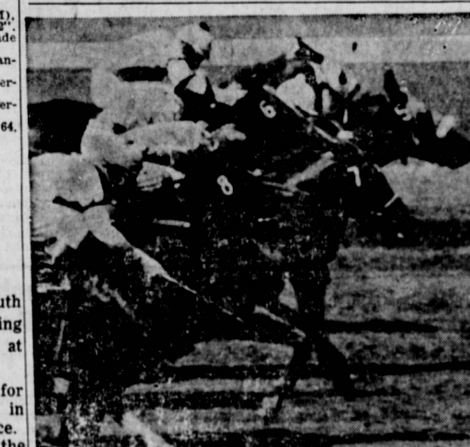
CLOSE QUARTERS... Quarter Horses at Los Alamitos charge to a photo finish as close as their number (8-7-6-5-4) in recent action.

Yesterday's Results West 10, Palos Verdes 1. El Segundo 8, Lawndale 0. Aviation 3, Lennox 2. Games Thursday Lawndale at West. El Segundo at Lennox. Aviation at Palos Verdes. Tuesday, May 3 Lennox at West. Aviation at El Segundo. Palos Verdes at Lawndale. Thursday, May 5 West at El Segundo. Aviation at Lawndale. Palos Verdes at Lennox.